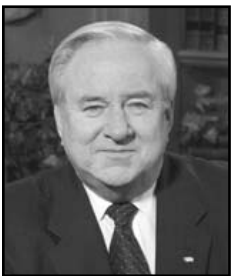
Rev. Jerry Falwell