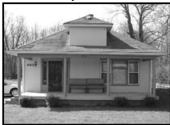
This little Westside church has the Devil in an uproar.

On April 4, 2007, the Civil Rights Division of the U.S. Justice Department filed an Amicus (“friend of the court”) brief, arguing that Indianapolis had violated the RLUIPA (Religious Land Use and Institutionalized Persons Act) by refusing to permit religious assemblies in a commercial area while allowing similar secular uses.