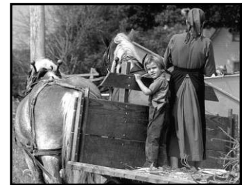
An Amish boy looks back as his sister drives the farm wagon.

Central Pennsylvania, particularly Lancaster County, is Amish country. It's common to steer around horse-drawn buggies on winding rural roads, or to see bearded men with their distinctive straw or black felt hats walking behind horse-drawn plows. Blond-haired children – girls in pinafores and barefoot boys in black suspenders – help their mothers in the many farmer's markets, or weed their father's fields with simple hoes.