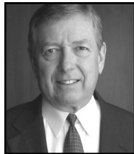
John Ashcroft, Bush's Attorney General, ordered 100 armed Federal Marshals to raid the Indianapolis Baptist Temple on February 13, 2001.