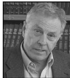
Morris Dees prepared material for the "Homegrown Extremists" Seminar attended by law enforcement agents.

The scripture says, " Woe unto them that call evil good, and good evil... ;" To make our law enforcement officials believe that the above activity is criminal, and that Christian patriots are a threat to the peace of our nation would have to be demonic in it self. I have never spoken at an "Identity" meeting, but what if I had, would that be a crime? See how these people put seeds of doubt in the minds of good people? They try to put you on the defense and we must not let them.